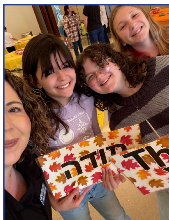
Religious School students and teachers show signs of gratitude for blessings — and pie. ;-)