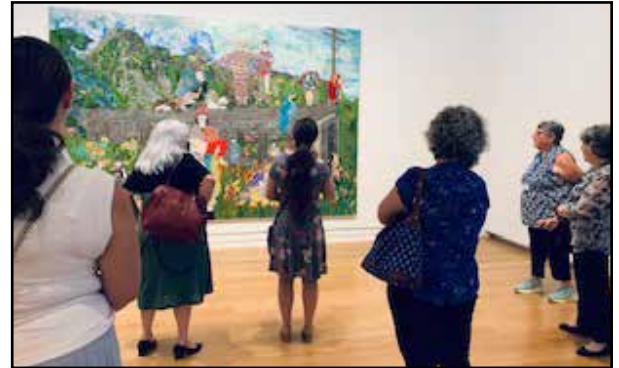
After the docent-led tour of "Women Painting Women" at The Modern Art Museum, the women of Sisterhood enjoyed brunch at Café Modern.