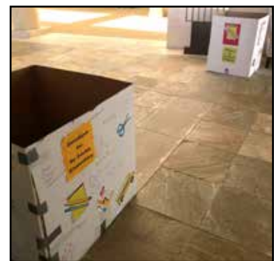
Boxes for school supplies for DeZavala Elementary are out in the lobby. Donate now!

We will deliver supplies as they are collected. The boxes will be out in the lobby through Yom Kippur, but the need begins now.