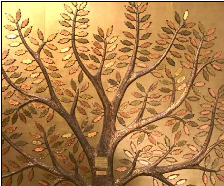
The Hall of Remembrance is the home of Beth-El's Tree of Life. Its shimmering bronze and copper leaves commemorate milestones in the lives of our fellow congregants – and new leaves are still sprouting.