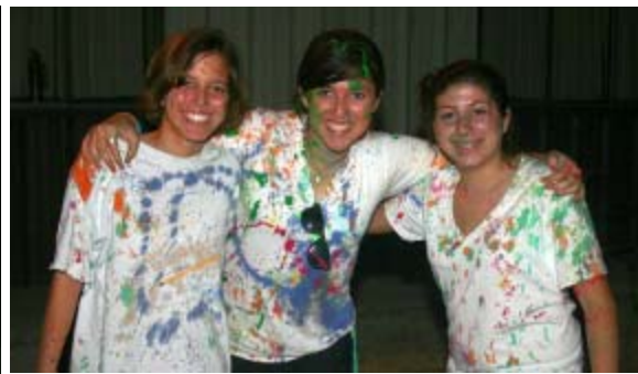
"Dirty" dancing means getting painted while dancing.