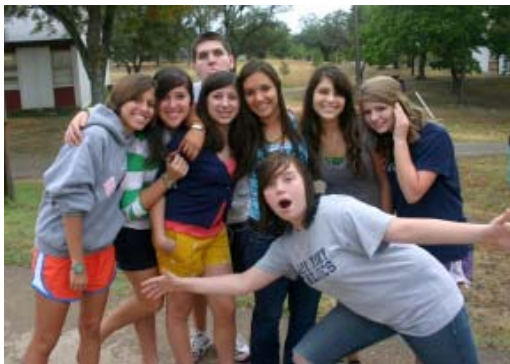
Hanging out during free time.