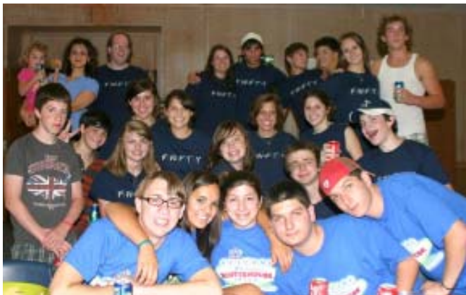
FWFTY at the general assembly.