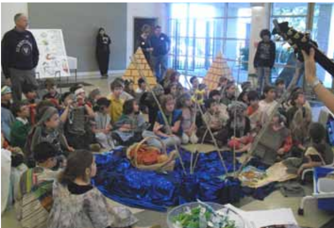
Passover - the Story of our People (Kindergarten - 3rd Grade).