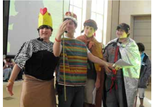
Purim play by the Midrasha (Grades 8-9).