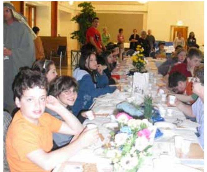
Fifteen Steps for Freedom (grades 4-7).