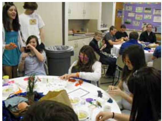
Who knows four? (grades 8-10)