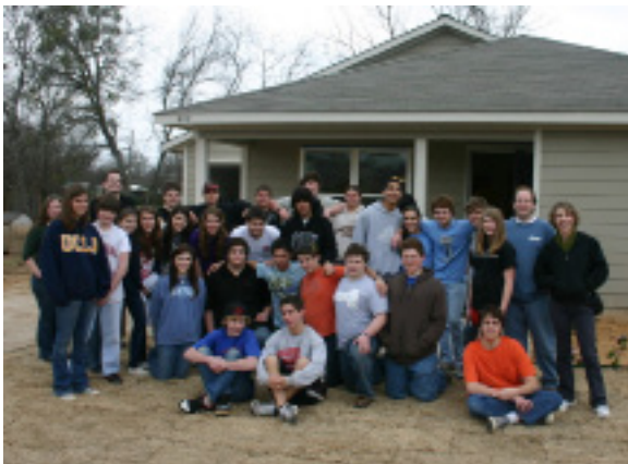
NFTYites from FWFTY, NETTY, and NOTTY complete their work on the Habitat House by laying sod, planting a flowers, and painting the house.

FWFTY's Metroplex Lock-In taught attendees about poverty, the homeless, and a little about life in shelters. We also led an amazing Shabbat service and volunteered our morning at a Habitat for Humanity home.