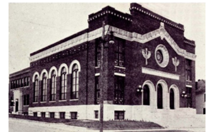
The second Temple, on Broadway Avenue

gregation strengthened from the ordeal. That red-brick building at Broadway and Galveston had many beautiful limestone features and enhancements, some of which were carefully incorporated into our current building.