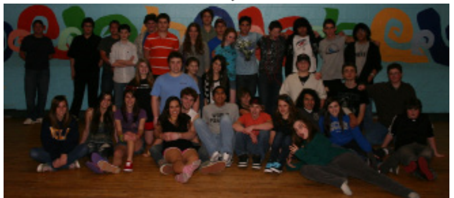
NFTYites from FWFTY, NETTY, and NOTTY at the skating rink.