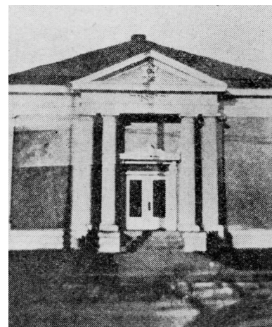
The first Temple, on Taylor Street